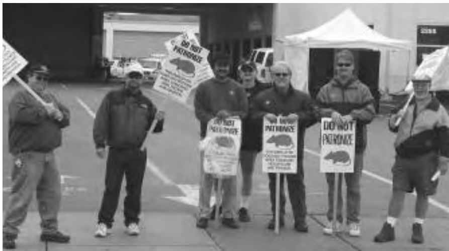
Local 1173 members maintain the Future Ford picket on a rainy March Sunday.