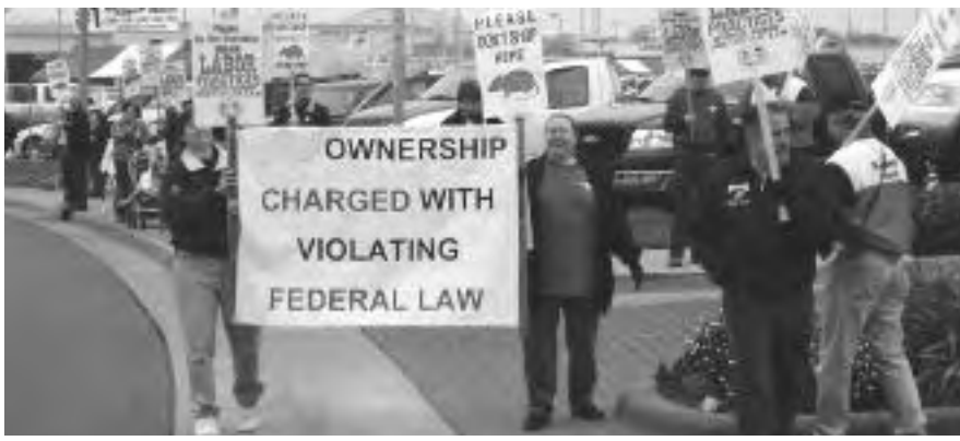
Workers make the case in front of Future Ford of Roseville in February.