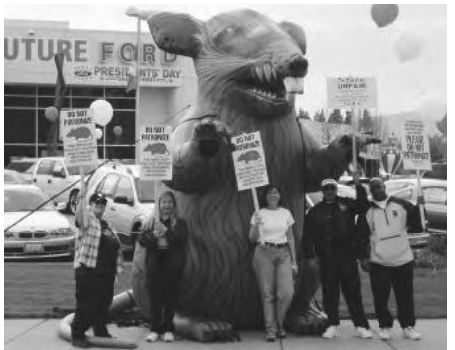
The Rat joins picketers at the March 6 Central Labor Council support rally at Future Ford of Concord.

Hollibush reports that there's been no movement by Future's man-