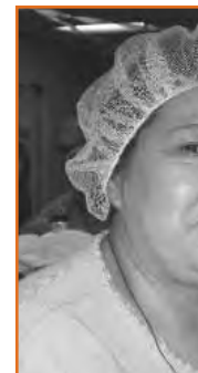
Migdale Foster Farm Help food

“We need to recuperate what we lost—holidays and double-time. Thank god I haven’t needed the union, but I’m glad it’s there for us. I’ll be at the meeting on Sunday!”