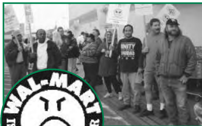
Members of the IAM, Teamsters, UFCW and other unions picketed Wal-Mart's San Leandro store on November 21.

On Thursday, November 21, thousands of union and community members nationwide challenged Wal-Mart to live up to its responsibilities as a corporate citizen. Launching the holiday season with pickets at more than 300 Wal-Mart stores, protesters called attention to the company's failure to pay a living wage, its refusal to provide decent benefits and its systematic denial of dignity to its workers.