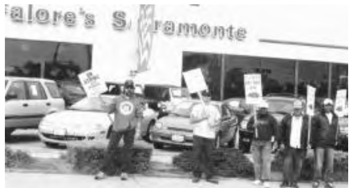
Members at Falore Chrysler-Jeep were striking just down the road from Serramonte Ford