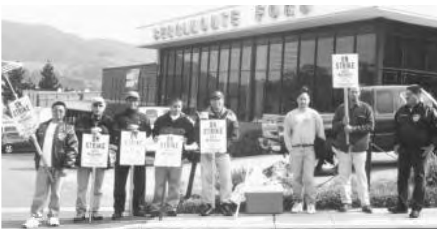
After five weeks on the street, Local 1414 members got a decent contract at Serramonte Ford.

Since the summer, members at five of District 190's ten Locals have gone on strike. The eight mechanics at Folsom Buick-Pontiac-GMC, have been on the street for more than three months, now.